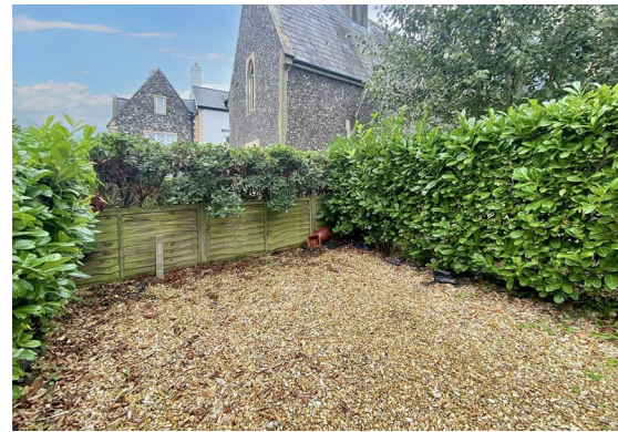
Portion of Garden